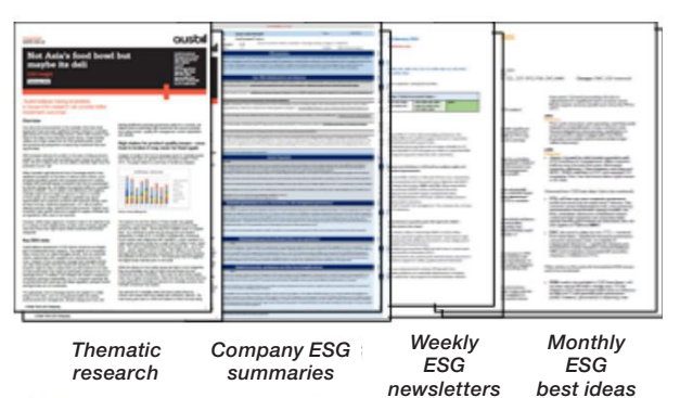
Ausbil's proprietary ESG research includes thematic research, company ESG summaries, weekly ESG newsletters and monthly ESG updates for stock selection meetings.

In the FY17 reporting season, we believe 44% of the companies analysed have net overall positive momentum on ESG factors, while 33% were neutral and 24% negative. This is in line with what we would expect, whereby the majority of companies should be improving.